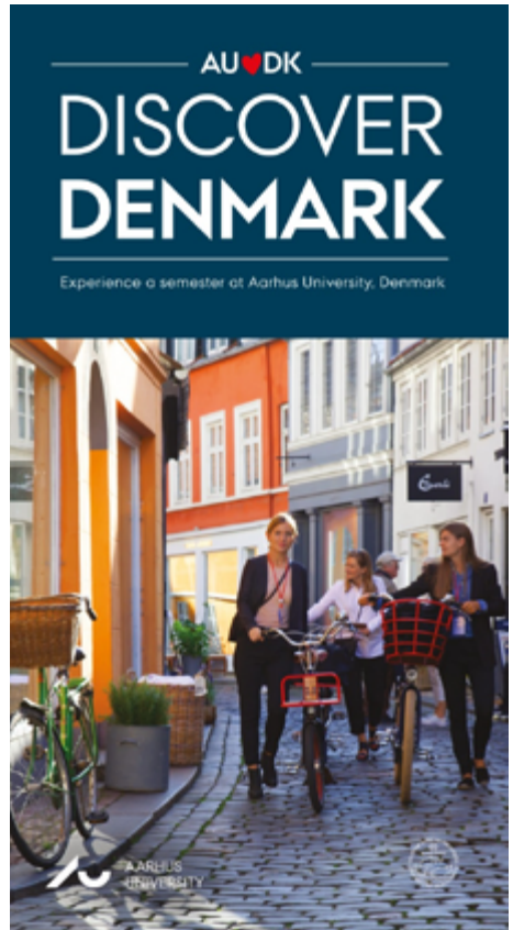
Cover page for a couple of our brochures